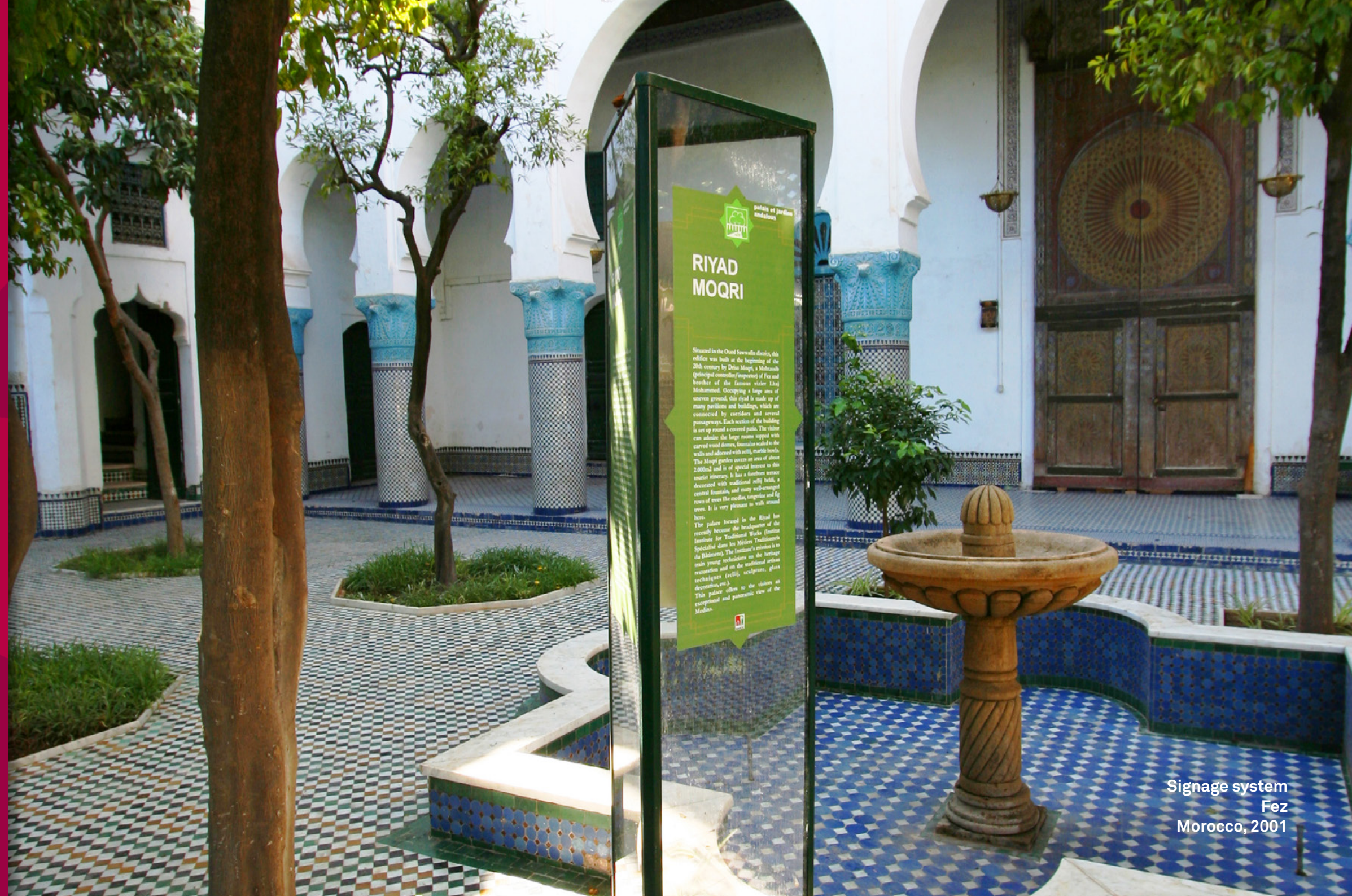
Signage system Fez Morocco, 2001

Cultural heritage is a non-renewable resource, and its exploitation for economic development must also be seen as an opportunity for its preservation