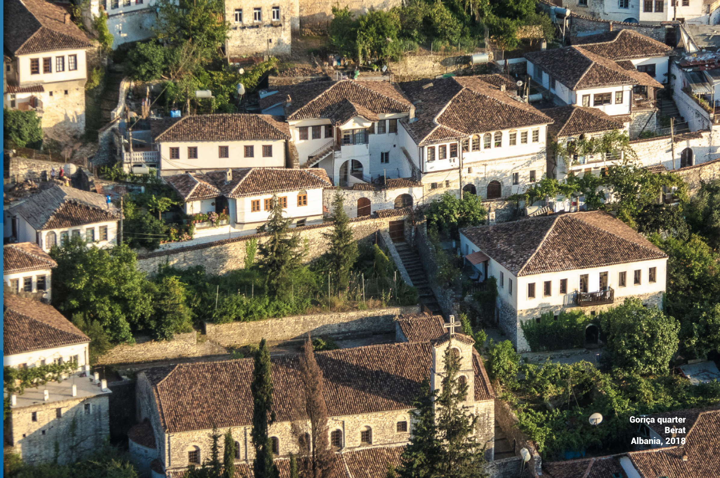
Goriça quarter Berat Albania, 2018

Our expertise in the field covers a full range of services including policies and strategies, master planning, urban upgrading and regeneration projects