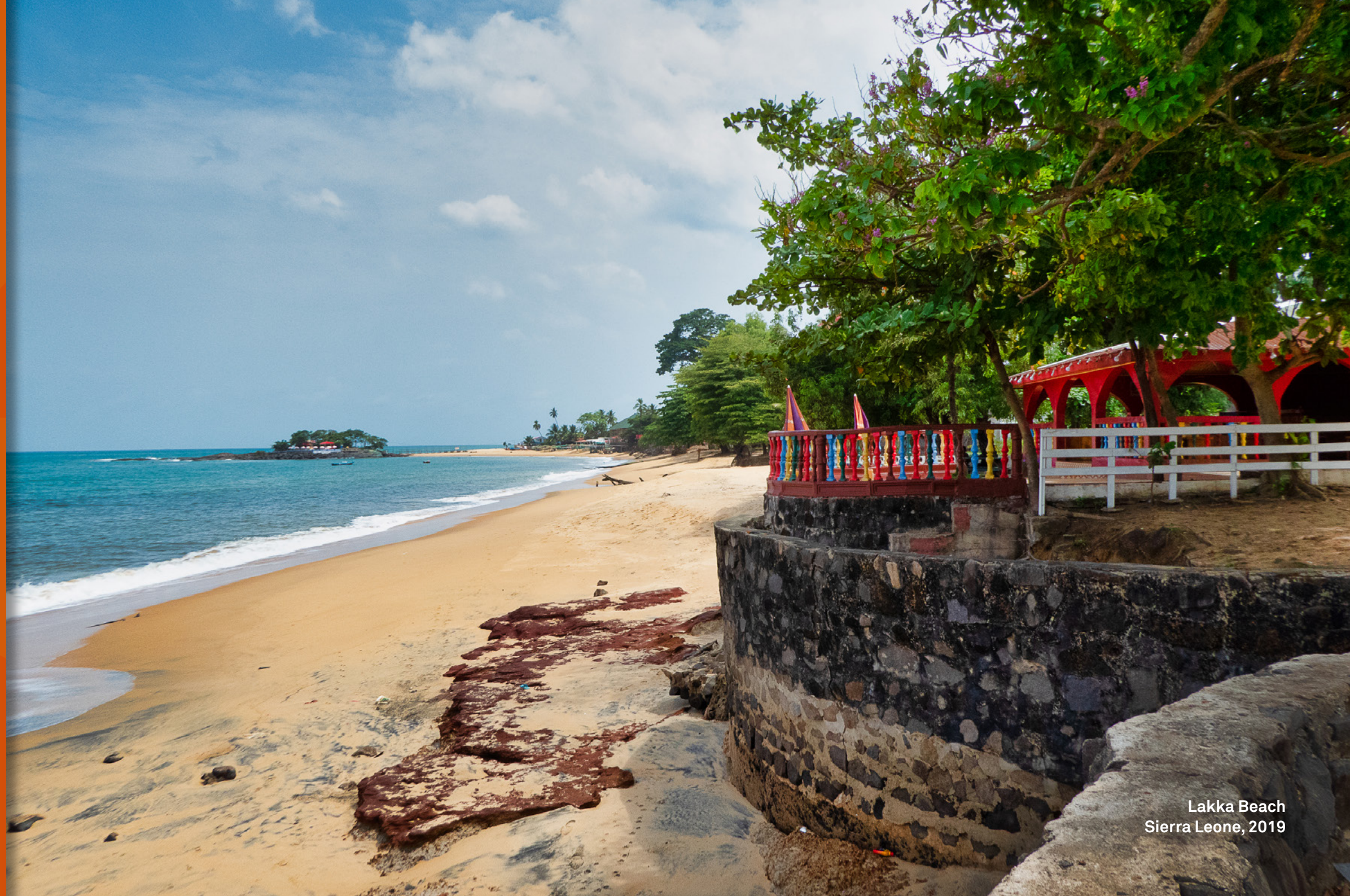
Lakka Beach Sierra Leone, 2019

Our experience in the sector ranges from national master plans to feasibility studies and design of specific tourism destinations